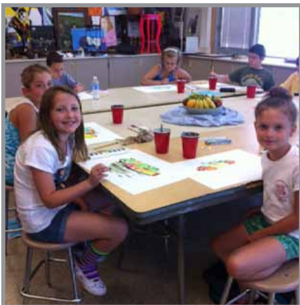
A group of Summer Enrichment students work on still life drawings.