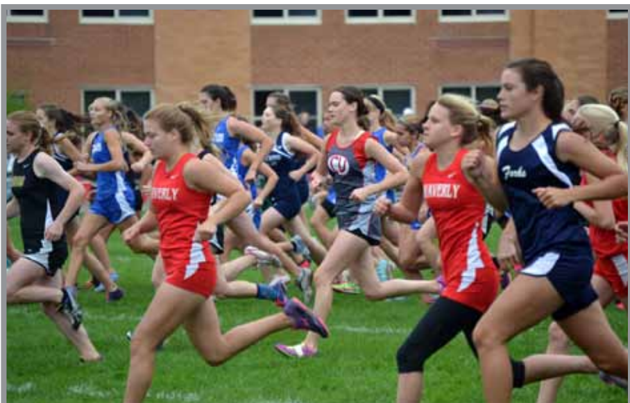
Runners from all over the region take off in the Varsity Girls race.

The 46th Annual McDaniel-Baxter Cross-Country Invitational was held September 14 at Chenango Valley High School. There were 27 teams participating with a total of 559 student-athletes. The Chenango Valley course is widely known -- loved by some and feared by others -- especially because of "Suicide Hill," a very long, steep hill located late in the race (after the two-mile mark) that always has a huge impact on the outcome.